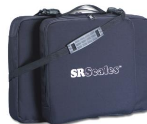
Figure 1: Optional Soft-Sided Carry Case

The SR241 Portable Infant/Adult Scale is a unique portable scale system that offers the versatility of being able to weigh infants, toddlers, and adults on one lightweight and weather resistant system. Weighing in itself at a mere seven pounds, this scale is specialized for use in pediatrician or physicians' offices and is also perfect for traveling nurse applications. The optional Soft-Sided Carry Case (Figure 1) protects the scale and facilitates its portability.