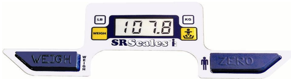
Figure 2: SR241/SR241SO Label