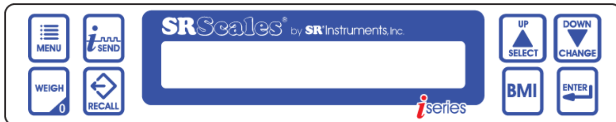
Figure 4: Button Display