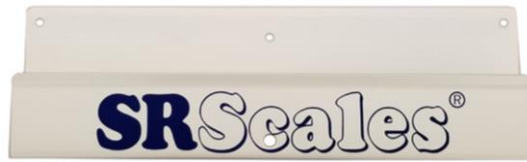
Figure 1: Wall Bracket