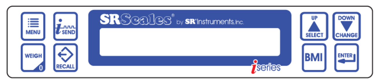
Figure 4: Button Display