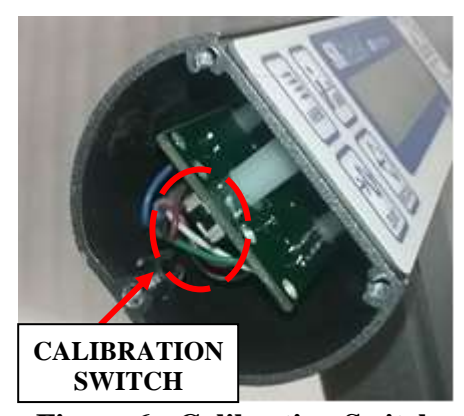
Figure 6: Calibration Switch Diagram

STEP 2: Put the scale system into Calibration Mode by switching the calibration switch on the display board (Figure 6), " CALIBRATION " will flash on the display.