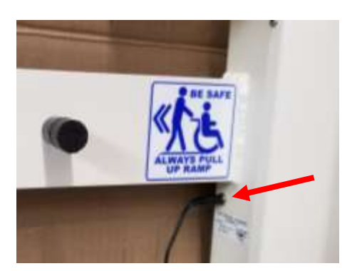
Figure 3: Power Cord Plug In

STEP 9: Carefully lower the SR7001i Series platform down into position for use. Connect the AC power plug into the power supply jack located in the right column support (Figure 3). Plug the power into a wall outlet.