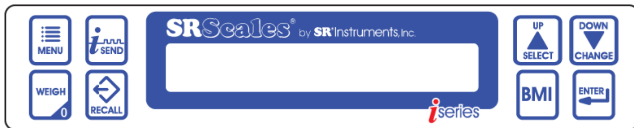
Figure 2: Button Display