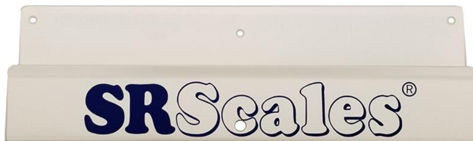
Figure 1: Wall Hanger