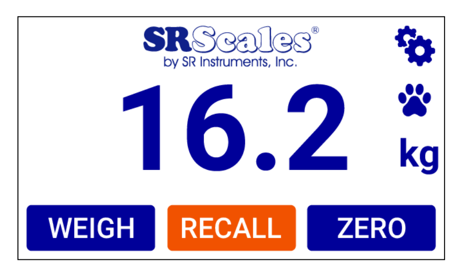
Figure 1: Display Screen

The "WEIGH" button is used to clear the Recall memory and start a new weighing WEIGH cycle.