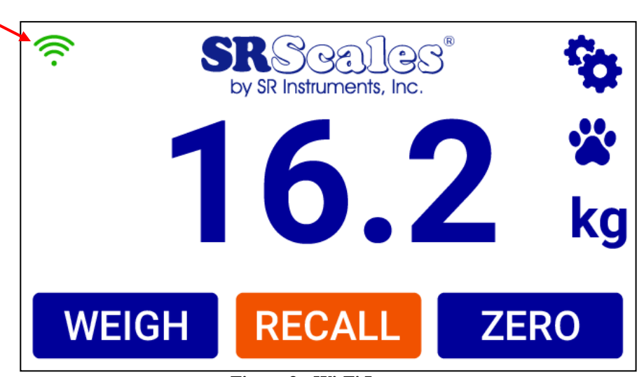
Figure 3: Wi-Fi Icon

If more than one SRV957 is in use, open the " Remote Display " menu on both the Wireless Auxiliary Display and the desired Primary Display. Verify matching "Primary MAC" addresses on both displays.