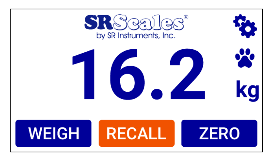
Figure 1: Display Screen

WEIGH The " WEIGH " button is used to clear the Recall memory and start a new weighing cycle.